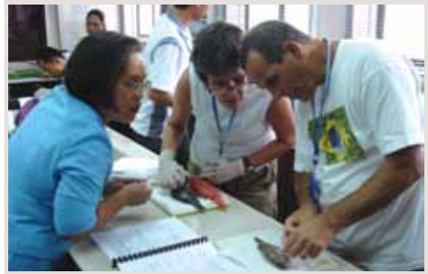
The participants and AQD scientist during the practical session of the Training Course on Marine Fish Hatchery