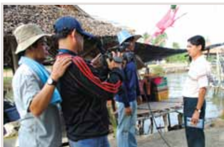
Practical session on media production as part of the Extension Training Course conducted by TD

Specifically for SEAFDEC/TD, 13 exhibitions and display of TD activities were organized to present and promote the roles of SEAFDEC in sustainable fisheries development in the ASEAN region. More than 55,600 visitors came to the TD booth. Moreover, three volumes of Advance Fisheries Technology Magazine and TD souvenirs such as key chains, bookmarks, T-shirts and polo-shirts were produced and distributed to the public and worldwide. The website of the World Small-scale Fisheries Congress was designed and integrated in the TD website. TD collaborated with the SEAFDEC Secretariat and other Departments for the production of a VCD on SEAFDEC to promote SEAFDEC visibility. Nineteen publications and reports were printed and served as updated information to develop the capacity of all those who are engaged in the fisheries, and distributed in all occasions to share and exchange information among fisheries-related organizations and through networks. TD also collaborated with FAO/GEF for the organization of the FAO/