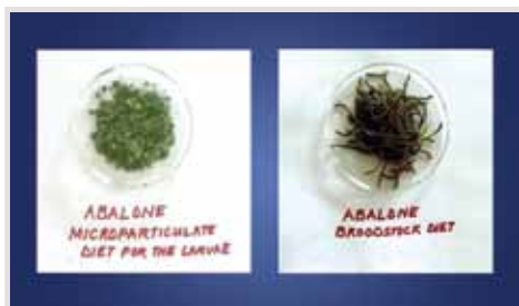
Newly developed broodstock and microparticulate diet for H. asinina