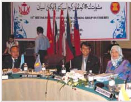
Regional Technical Consultation on Adaptation to a Changing Environment (above); and SEAFDEC Secretary-General participation in the 18 th ASWGFi Meeting (left)

Meeting of RAC on 2-4 September 2009 in Thailand, were reported to SEAFDEC Council during its 42 nd Meeting in April 2010.