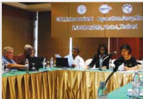
SEAFDEC representative chairing the CWP Inter-session Meeting in Phuket, Thailand

During the year, SEAFDEC organized the Regional Technical Consultation on Fishery Information and Statistics in Southeast Asia on 19-21 January 2010 in Bangkok, Thailand particularly to provide a platform for exchanging experiences in the development of the National Status and Trends on Fisheries and Aquaculture (STF and STA) by the participating countries, namely: Philippines, Thailand and Indonesia. The Consultation provided recommendations on policy directives, priority areas and strategies for future development and implementation of activities, and on future cooperation relevant to the improvement of fishery statistics and information in the region. Moreover, SEAFDEC also provided relevant regional statistical information during the 23 rd Session of CWP and the 6 th Session of the Fishery Resources Monitoring System (FIRMS) Steering Committee on 22-26 February 2010 in Hobart, Australia. The involvement of SEAFDEC in CWP and FIRMs would ensure that the development of statistics of the region are in line with those undertaken at the international level, and that the regional specificity and uniqueness of fisheries in the region are properly reflected and globally recognized.