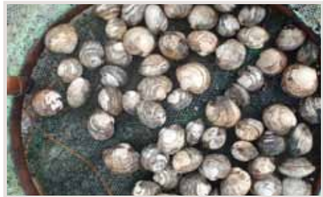
Anodontia philippiana (clams) used as bioremediator in an intensive milkfish cage culture in Igang Marine Station, Nueva Valencia, Guimaras