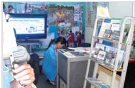
AQD exhibit during the 47 th Fish Conservation Week celebration in the Philippines

AQD has also continued to enhance its visibility in the international community through publications. AQD published 26 scientific papers in ISI-CC covered journals, another five in non-CC covered journals and six, in books or conference proceedings. AQD Researchers also participated actively in various international fora held in 2010. To disseminate the newest information and technology packages to fish-farmers and other stakeholders in Southeast Asia, AQD published six 'How-to manuals' that include: 1) sandfish seed production; 2) prevention of viral nervous necrosis in marine fish hatcheries; 3) abalone grow-out; 4) mud crab nursery in ponds; 5) sea bass grow-out in ponds; and 6) milkfish fingerling production. AQD also produced five flyers on various aquaculture practices as well as two books on reforming Philippine science and sea turtles. Two videos on the AQD stations in Dumangas and Igang were made and distributed. AQD also participated in 5 aquaculture fairs and exhibits held in the Philippines. AQD also published an annual report ( AQD Highlights 2009 ) and a monthly newsletter ( AQD Matters ) that has more than 700 recipients on the mailing list. AQD continued updating its website ( www.seafdec.org.ph ) and sending out press releases to enhance the Center's visibility. More than a hundred news items in the mass media and the internet have appeared about SEAFDEC or AQD.