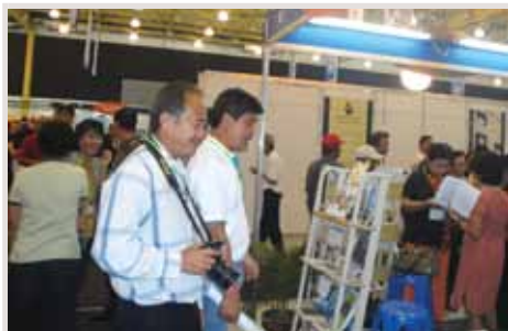
SEAFDEC/AQD participated in AgriLink, the Philippines' largest agricultural trade fair

SEAFDEC/AQD continued to demonstrate its significant contributions to aquaculture development in the region through building institutional capacities and developing a critical mass of experts on aquaculture technologies. In 2010, AQD conducted a total of 28 training sessions on various aspects of aquaculture and trained 472 participants, representing the government workers, private sector practitioners, fisherfolk and farmer communities from the Philippines and representatives of partner countries from the ASEAN region. Several students, mainly from the Philippines, and foreign interns were also trained during the year.