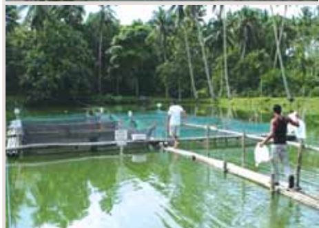
Cage culture trial of sea bass in freshwater reservoir in the Philippines