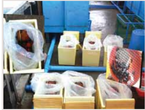
Transport of abalone juveniles using oxygenated bags with 12% water

In the nursery phase, abalone is usually cultured using the flow-through systems accounting for 15-30% of the hatchery operating cost. Results of a study to reduce operating cost, have shown higher survival in Gracilaria -fed abalone reared in both flow-through system and recirculating system compared to the artificial diet-fed abalone reared in both flow-through and recirculating systems. Furthermore, highest growth and survival were recorded when abalone juveniles were reared in black boxes followed by those reared in round mesh cages.