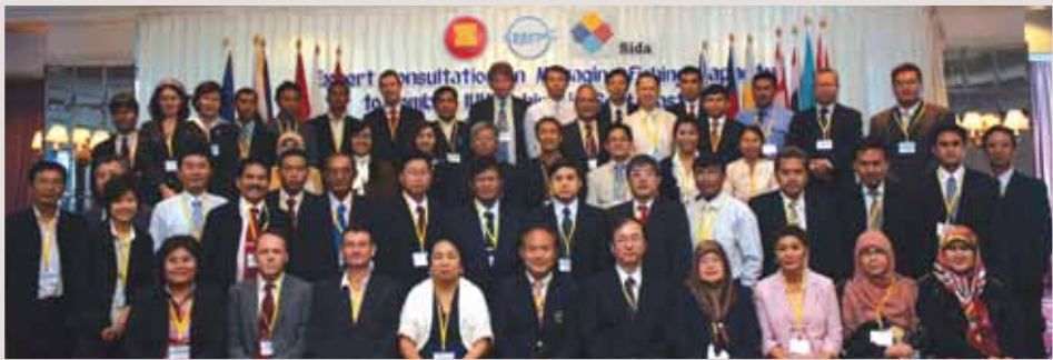
Participants in the Expert Consultation on Managing Fishing Capacity to Combat IUU Fishing in Southeast Asia

SEAFDEC also participated in relevant events to share information and experiences based on the activities undertaken by SEAFDEC on management of fisheries capacity and combating IUU fishing, such as the Second ASEAN Fisheries Consultative Forum (21-25 June 2010, Brunei Darussalam), the National Workshop on the Bay of Bengal Large Marine Ecosystem of Mergui Archipelago (13-14 July 2010, Ranong Province, Thailand), the Third APFIC Regional Consultative Forum Meeting (1-3 September 2010, Juju, Korea), and the Seminar on Monitoring, Control and Surveillance (MCS) Network and Fishery Resources and Management under the Sub-Regional Group of Southern and Eastern Area of South China Sea (SESCS) and Sulu-Sulawesi Seas (SSS) (8-10 December 2010, Malacca, Malaysia). SEAFDEC also collaborated with FAO/APFIC, the FAO Global Program and the Regional Plan of Action to Promote Responsible Fishing Practices including Combating IUU Fishing in the Region (RPOA-IUU). Furthermore, SEAFDEC since mid-2010 had explored ways and means of having the activities of the SEAFDEC-Sida project complement with those of the new JTF initiative on combating IUU fishing, in order to reach a common goal.