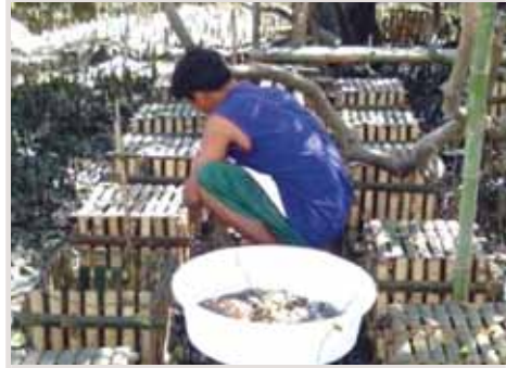
Mud crab fattening set-up during low-tide