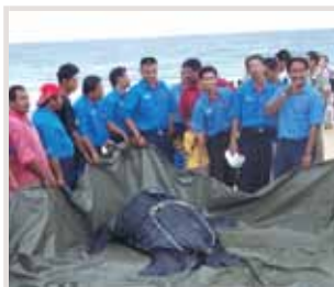
Research on sea turtle foraging populations by satellite telemetry study

Tagging of sea turtles using inconel tags was continued by MFRDMD at the focused nesting sites of the participating countries, while tag recovery had been monitored. In Malaysia, more than 1,300 turtles were tagged in 2010 comprising 80% green turtles while the rest were hawksbill, olive Ridley and leatherback turtles. Moreover, 65 sea turtles were also tagged in Myanmar, 423 in the Philippines, and 357 in Vietnam. In addition to inconel tagging, satellite telemetry studies for a leatherback turtle was also conducted in collaboration with the Department of Fisheries Malaysia. On the part of TD, collection of information on the interaction of sea turtles with fishing was continued in order to come up with responsible fishing gears that could reduce the sea turtles by-catch. The activity was also aimed at promoting and raising awareness on the use of C-hook in hook-and-line fishing in the SEAFDEC Member Countries to minimize the by-catch of sea turtles.