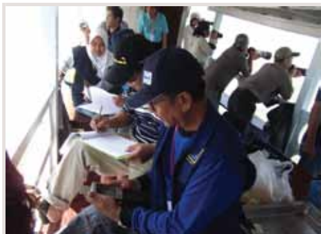
Onboard sighting survey of cetaceans

The on-going activities focused on gathering information on cetaceans (both marine and freshwater species) through sighting programs making use of the existing research cruises of SEAFDEC and the Member Countries, gathering of relevant secondary data, and enhancing human resources capacity of the Member Countries in undertaking relevant research to better understand the abundance of cetaceans in the EEZs and beyond of the Southeast Asian countries. In 2010, cetacean sightings were