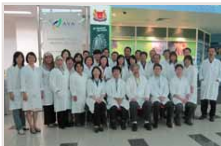
Participants in the Regional Training Course at the Toxins Laboratory in the Veterinary Public Health Centre of AVA