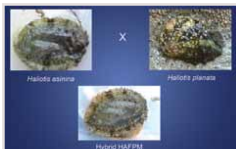
Hybrid HAFPM was attained by using female H. asinina with male H. planata

However, in order to reduce dependence of abalone on the diatoms, a microparticulate diet with average particle size of 4–5 \mu\text{m} , for young post-larvae was formulated. The protein content of the diet was 37%, which was higher than that of the diatom feed (14.9%). Moreover, in the refinement of transport techniques for abalone, the results of transport trials for abalone veligers (with and without shaking) showed that survival was affected by the combined effects of loading density and transport time. After 1 hour and 5 hours transport time, the survival of larvae at different loading densities was comparable but after 10 hours of transport, survival of larvae was significantly lower when packed at a density of 100 larvae \text{ml}^{-1} compared to those packed at 50 and 25 larvae \text{ml}^{-1} (41.62%). Similarly, in the transport of juvenile abalone, survival increased with decreasing loading density, with significantly higher survival rate attained after 24 hours of transport when abalone were packed at 25 individuals/pipe compared to higher packing density of 50 individuals/pipe.