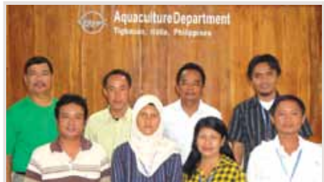
Participants of the International Training Course on Community-based Freshwater Aquaculture for Remote Areas of Southeast Asia.

To facilitate the transfer and dissemination of basic and/or applied aquaculture technologies and knowledge, and human capacity building in SEAFDEC Member Countries, four training programs were implemented: Marine Fish Hatchery Training Program (26 May-1 July 2010); Abalone Hatchery Training Program (8-28 July 2010); Rural Aquaculture Program – International Training Course on Community-based Freshwater Aquaculture for Remote Areas of Southeast Asia (08-18 November 2010); and On-site Feed Preparation Training