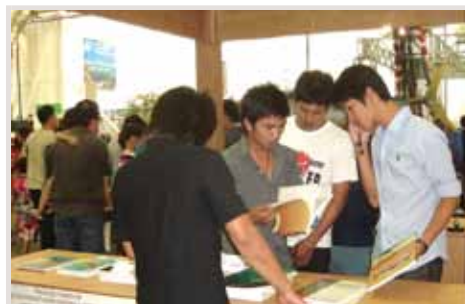
Information dissemination of SEAFDEC information materials