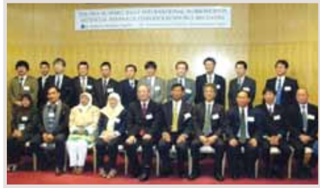
TD in collaboration with the Fisheries Research Agency of Japan organized a Workshop on Artificial Reefs for Enhancement of Fishery Resources

At the regional level, TD collaborated with the Fisheries Research Agency (FRA) of Japan to support the sharing of information and experiences among the Southeast Asian countries and Japan on various aspects related to artificial reefs. Moreover, FRA also organized the Workshop on Artificial Reefs for Enhancement of Fishery Resources in Tokyo, Japan on 11-12 November 2010, where information on installation of artificial reefs, scientific-based designs, and methods for evaluation of artificial reef deployment projects, were shared and discussed among the representatives from the countries as well as those from SEAFDEC and FRA.