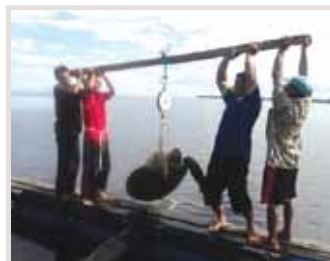
Research on sea turtle foraging populations by genetic study