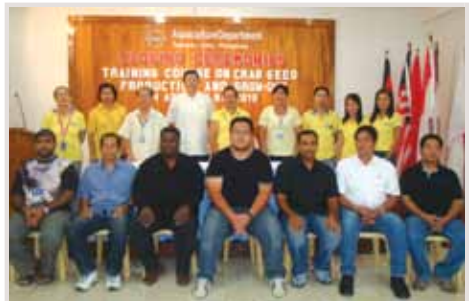
The participants and AQD staff during the closing ceremony of the Training Course on Mud Crab Seed Production and Grow-out.