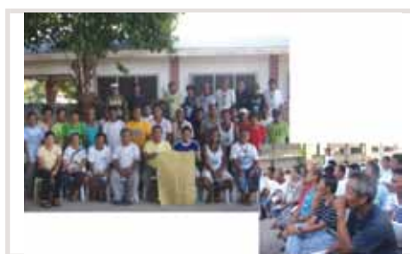
Organized fishers play a key role in stock release and enhancement demonstration site management.