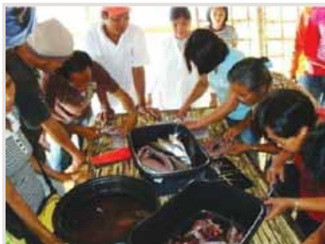
Participants tried their hands at deboning, marinating, and smoking bangus during the milkfish post-harvest course held in April 2010