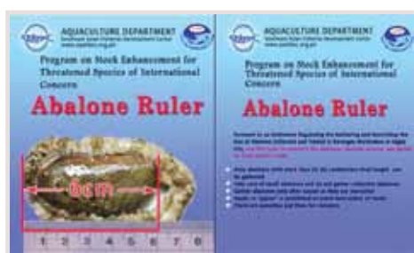
Abalone ruler as a tool to enhance compliance of fisherfolks to abalone catch-size regulation