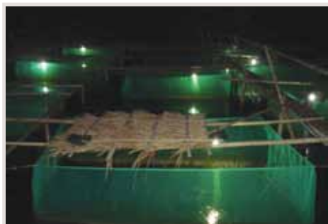
Night view of sea bass nursery culture in illuminated floating cages in ponds at AQD's Dumangas Brackishwater Station

protein, the average body weight attained was 27 g after 60 days of culture. In feeding the Pompano with milkfish commercial feed, commercial milkfish feed + commercial pompano feed or commercial pompano feed, initial results showed that those fed commercial pompano feed had the highest average body weight (536 g) while lowest, in stocks fed milkfish commercial feed.