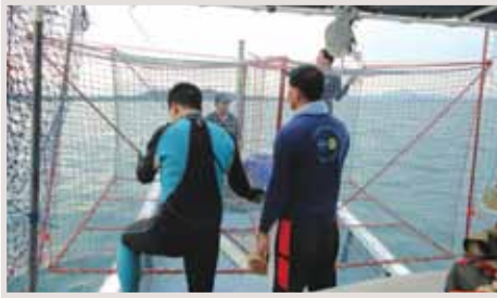
Survey on identification and evaluation of fisheries ecosystem

fish trap, bottom gill-net, hand line, benthos collector, juvenile fish trap. In addition, species diversity observation using the underwater video recorder was also conducted.