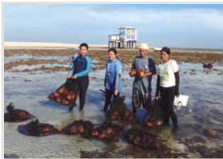
The stock enhancement team prior to release of AQD hatchery-bred H. asinina in Sagay Marine Reserve