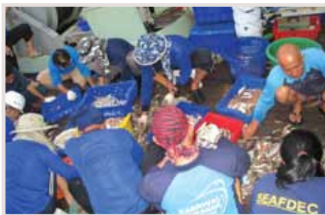
Onboard sorting of fish species caught during the fishery resources surveys

For Malaysia, TD, in collaboration with the Department of Fisheries Malaysia and Fisheries Research Institute of Sarawak, SEAFDEC/MFRDMD, and Office of State Fisheries Sabah, undertook a cruise to conduct actual survey on fisheries resources (including biological and physical oceanographic parameters) in Sabah and Sarawak Area from 28 June to 11 August 2010. Sampling gears, namely beam trawl, bottom vertical longline, deep-sea trap, squid jigging, pelagic longline, were used for the survey. During these two cruises, on-the-job training on methodologies for fisheries resources survey in un-trawlable ground of Malaysian and Brunei waters also provided.