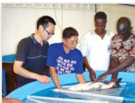
Assessing the sexual maturity of bighead carp broodstock during the Freshwater Fish Breeding and Farming Course at AQD's Binangonan Freshwater Station