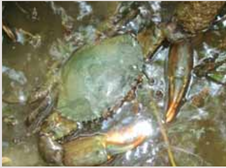
Mud crab inside bamboo pen for fattening

higher percentage of crabs injected with crab saline or with 0.3 \mu\text{g/g} serotonin had maintained dominance in shelter occupancy over smaller crabs compared to those injected with the higher dose of serotonin. However, a similar percentage of saline-injected and serotonin-injected crabs were found outside the shelters during night time, may be due to their nocturnal feeding characteristic.