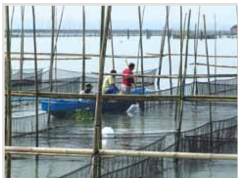
Cage culture of freshwater prawn by a Philippine local multi-purpose cooperative