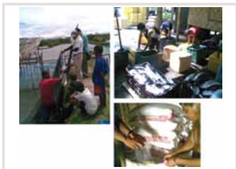
Sampling of fish and commercially formulated aquaculture feeds to assess the levels of chemical contaminants