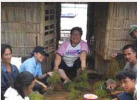
Discussion with seaweed farmers in central Philippines

To develop molecular-based techniques for genetic identification and differentiation of red seaweed species and variants, six varieties of Kappaphycus and Eucheuma were selected as the first batch of samples for the optimization of DNA extraction and PCR protocols. In all tested samples DNA yield (up to 105 ng/μl) and purity, with the freshly frozen and freeze-dried samples showed comparably higher DNA yield than the dried-powdered form. In the identification of commercially-important seaweeds that could potentially be useful as source of anti-microbial substances against common aquatic pathogens, six seaweed species of Kappaphycus and Eucheuma were used in optimization of water and ethanol extraction protocols. In the initial anti-bacterial screening of the six crude ethanol extracts, no significant zone of inhibition was observed against the luminous bacteria, Vibrio harveyi , by disc diffusion assay.