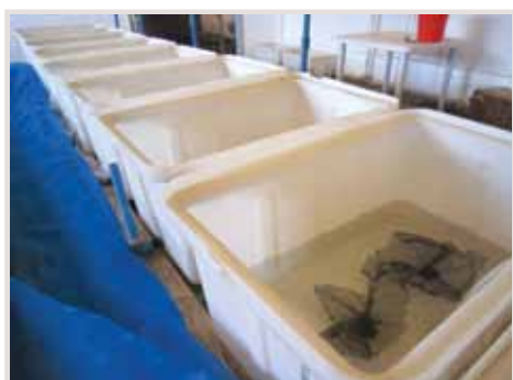
Experimental set-up for rearing M. rosenbergii post-larvae in indoor tanks