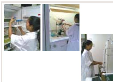
Samples of fish, shrimps and local feeds are being analyzed for oxytetracycline and oxolinic acid