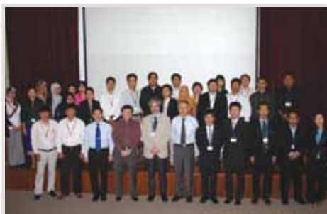
The Consultation on Chemical and Drug Residues in Fish and Fish Products in Southeast Asia

Based on the methodologies introduced during the training, the participants were expected to set up their biotoxins analysis methods in their respective countries, and continue the activities in conducting a survey on biotoxins monitoring in 2011 focusing on the PSP in green mussels and baby clams. The results of the survey would be collated by MRFD for the Technical Compilation of Biotoxins Monitoring in the ASEAN region.