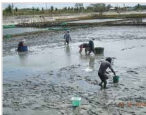
Brackishwater pond is totally drained to collect the aquatic species and assess the composition and volume of the pond by-catch