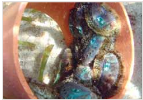
AQD hatchery-bred H. asinina inside PVC pipes after release.