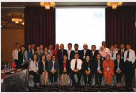
Regional Technical Consultation on Traceability Systems for Aquaculture Products in the ASEAN Region conducted in Singapore

In view of such developments, MFRD started in 2010 the implementation of a 5-year project on Traceability Systems for Aquaculture Products in the ASEAN Region to enable the regional aquaculture industries to enhance their capabilities in implementing appropriate traceability systems for aquaculture products and to meet international traceability requirements in the network of aquaculture production, marketing, and trade. The project aimed to provide a platform for the sharing of information and experiences among the ASEAN countries on the implementation of traceability systems for aquaculture products in the region and to promote the implementation of the traceability systems in the ASEAN region.