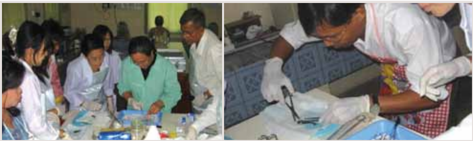
Practical session of the On-site Training on Freshwater Fish Health Management in Myanmar

This project also implemented training programs to facilitate the transfer and dissemination of information and technology on fish health management to the Member Countries, such as: 1) Distance learning course on principles of health management in aquaculture (AquaHealth Online) (26 July to 17 December 2010); and 2) On-site training on basic fish health management of freshwater fishes with emphasis on zoonotic parasites (6-8 December 2010 in Myanmar). Moreover, 13 scientific papers related to fish health management were published in international journals.