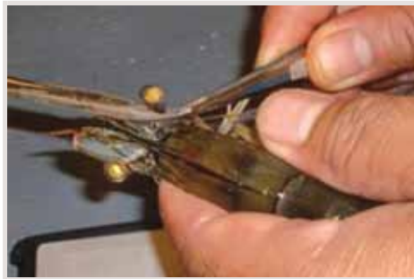
Ablation of new F 1 P. indicus broodstock

Using wild-sourced marine annelid Perinereis quatrefagesi , as an ingredient to replace a mixture of fish meal, shrimp meal and/or squid liver meal in the diets of juvenile crustaceans, the results showed that feeding the diet containing Perinereis meal promoted high growth in shrimp and mud crab juveniles. Considering the importance of feeding marine annelid-meal could reduce dependence on fish meal for feeds, the biology of two species of marine annelids was studied for better understanding of their culture requirements. Perinereis oil which is found to contain relatively high lipids with good HUFA profile has high potential to replace fish oil in aquafeeds.