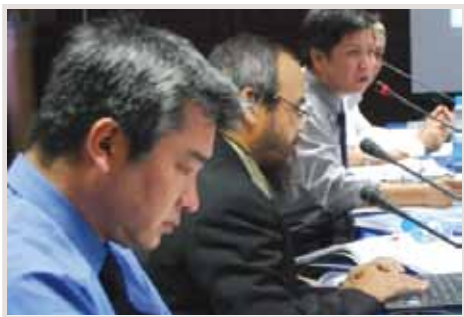
The ASEAN-SEAFDEC RTC on Adaptation to a Changing Environment

the effects of climate change and to reduce the impacts of the sector to climate change.