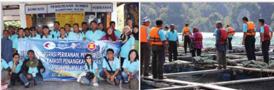
On-site Training on the Integration of Fisheries Management into Habitat Management and the Management of Fishing Capacity