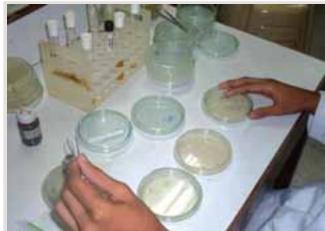
Screening for anti- Vibrio harveyi activity of Kappaphycus crude ethanol extracts by disc assay method