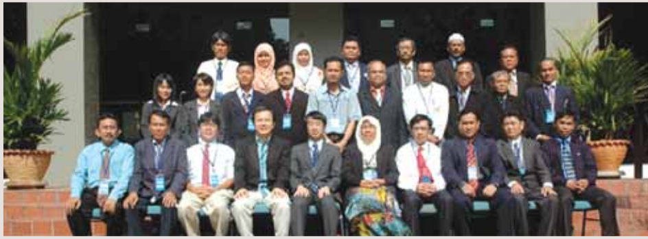
Participants of the 3 rd Core Expert Meeting on economically-important pelagic fish species held on 8-9 March 2010 in Malacca, Malaysia.

conducted by each participating country, and formulated the implementation plan for 2010 and onwards.