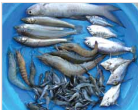
Sample of by-catch or non-crop species collected from brackishwater pond

Four cages stocked with the same density of milkfish and fed the same amount and type of food were monitored for physico-chemical parameters and organic matter, where constantly increasing ammonia, phosphate and sulfide concentrations were observed in the water and sediment, but started to decrease upon the start of partial harvesting of milkfish. The highs and lows of nutrient concentrations were attributed to the volume of feeds deposited on the substrate, but nitrate and nitrite concentrations were highest only at the start of sampling and maintained low concentrations up to the last water sampling. In assessing the impacts of different pond practices on biodiversity in ponds and adjoining mangroves and shores, the ponds used for technology verification projects at Dumangas Brackishwater Station (DBS) were totally drained and by-catch (non-crop) species were obtained for identification. Results showed a very high diversity of non-crop species (fishes, crustaceans, mollusks, echinoderms), mostly naturally seeded by the tides, but chlorinated ponds had much lower diversity and volume of non-crop species. Catch from the small-scale fishing around the mangrove outside the DBS includes many of the same species caught inside the ponds.