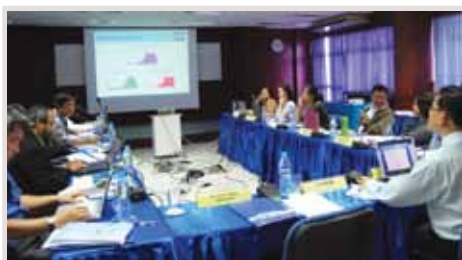
The ad hoc meeting of shark experts

During the year, SEAFDEC in close consultation with Member Countries continued to monitor the international fisheries-related issues that emerged at the regional and international levels that could impact the sustainable development of fisheries of the region. One important issue that had been paid particular attention was the proposed listing of sharks and other economically-exploited aquatic species in the CITES Appendices. In this regard, SEAFDEC organized the ad-hoc Meeting of Shark Experts in the Southeast Asian Region (28-29 January 2010, Samut Prakan, Thailand) to discuss the scientific and technical information available in the region, and develop policy recommendations on sharks, especially on the improvement of information collection and works to support the management and assessment of sharks in the region. The issue of listing commercially-exploited aquatic species to CITES Appendices was further discussed at the Regional Technical Consultation on International Fisheries-related Issues (2-4 February 2010, Bangkok, Thailand), where harmonized position was developed among the Member Countries to oppose the listing of several sharks and precious coral species into the CITES Appendices, which was successfully reflected by the Member Countries during the 15 th Session of the CITES (COP15-CITES) in March 2010.