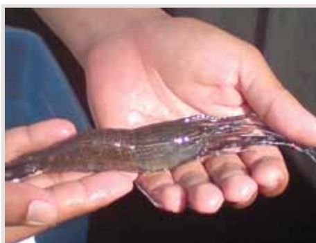
Freshwater prawn ( M. rosenbergii )