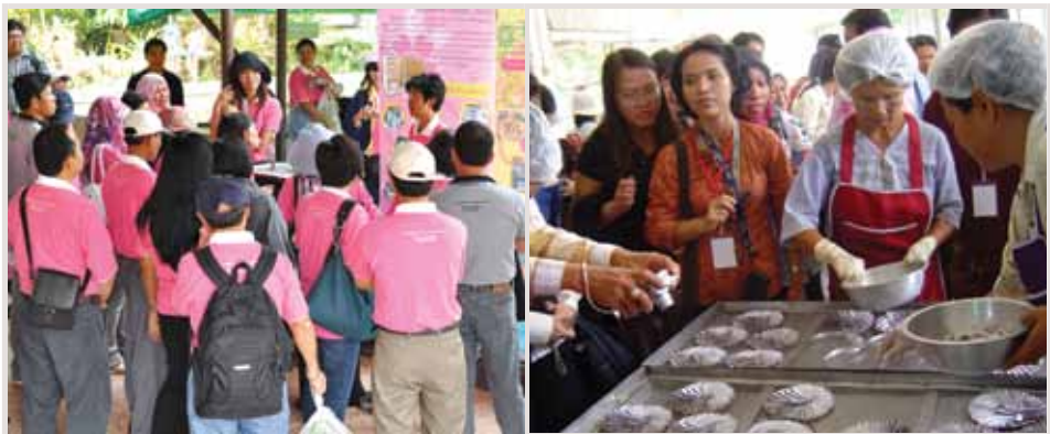
The 2 nd Regional Technical Consultation on the Promotion of "FOVOP" in the ASEAN Region

For the HRD on Poverty Alleviation and Food Security by Fisheries Intervention since 2009, a series of activities were undertaken under five thematic areas, namely: 1) Local/indigenous institution and co-management (led by TD); 2) Responsible fishing technologies (led by TD); 3) Backyard fishery post-harvest technology (led by MFRD); 4) Rural aquaculture (led by AQD); and 5) Inland fisheries development (led by MFRDMD), starting from the train-the-trainer activities, followed by on-site HRD activities in participating countries, namely: Cambodia, Indonesia, Lao PDR, Malaysia, Myanmar, Philippines, Thailand and Vietnam. Training materials on each thematic area were developed and used during the project on-site training activities conducted in Vietnam (6-10 January 2010), Thailand (11-15 January 2010), Philippines (8-12 February 2010), Lao PDR (18-22 January 2010), and Thailand (15-19 March 2010). Following the on-site activities, the Second RTC was organized on 17-19 August 2010, Bangkok, Thailand to exchange experiences in the implementation of activities, and come up with the draft "Regional Policy Recommendations on Poverty Alleviation by Fisheries Intervention". The draft Regional Policy was submitted to the 13 th Meeting of the FCG/ASSP in December 2010, and later to the higher authorities of the ASEAN and SEAFDEC for consideration and endorsement.