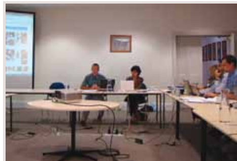
The 23 rd Session of CWP and the 6 th Session of the Fishery Resources Monitoring System (FIRMS) Steering Committee

SEAFDEC also participated in the COFI Sub-committee Meeting on Aquaculture organized from 27 September to 1 October 2010 in Phuket, Thailand and the 1 st CWP Inter-session Aquaculture Group Meeting on 2 October 2010 in Phuket, Thailand. The participation of SEAFDEC in such fora could support the further streamlining of regional statistics with international standards, classification and definition of fishery statistics at the international level especially on aquaculture statistics. Specifically, in the development of the CWP Handbook on Standard of Aquaculture Statistics, SEAFDEC was requested to provide expertise to enhance the capacity and improve the methodologies in data collection as well as the streamlined definitions and standards for statistics data collection in the future.