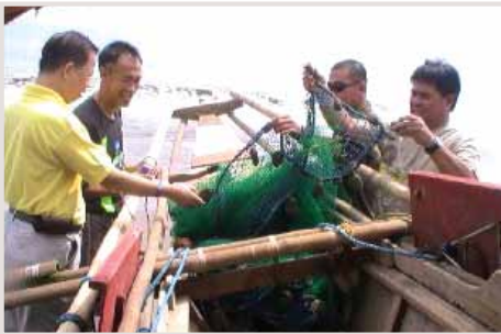
Practical Session on discards and by-catch management

TD has implemented activities to promote responsible fishing technologies and practices in collaboration with the Southeast Asian countries, particularly under the program on “Responsible Fishing Technologies and Practices (Fishing in Harmony with Nature)”. In 2010, TD continued the activities by extending technical assistance to the Member Countries on the aspects of selective fishing gears and devices to reduce discards and by-catch of juveniles and trash fish in the region. Specifically, TD advanced the adoption of selective fishing gears to the Department of Fisheries of Thailand (1-2 September 2010), while assistance for assessing the impacts from various kinds of fishing gears and practices on the fisheries resources, environment and ecosystem was also extended to the Philippines (18-22 October 2010) in collaboration with its Bureau of Fisheries and Aquatic Resources with support from Tokyo University of Marine Science and Technology of Japan (TUMSAT) and Kasetsart University of Thailand.