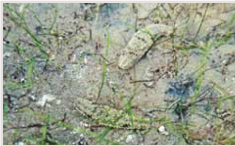
Sandfish juveniles on sandy-muddy substrate, typical of coastal mudflat with Halodule seagrass

A study that determines the social acceptability of marine cage culture as a livelihood option for fishers affected by oil spill in four coastal barangays in Nueva Valencia, Guimaras indicated that cage culture is socially and economically acceptable as livelihood option for those fishers and that the negative impacts of aquaculture to the environment can be addressed appropriately if cage culture is managed effectively and efficiently.