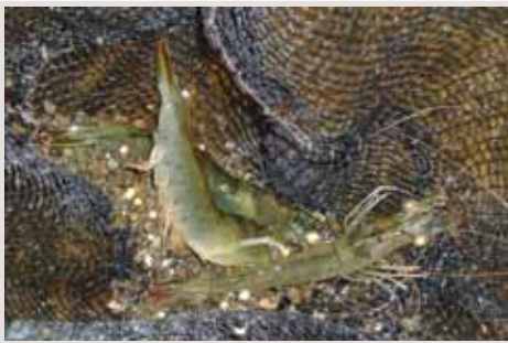
Penaeus indicus broodstock

polychaetes were used, the resulting feed had low efficiency in stimulating ovarian development, while the broodstock fed the diet had significantly lower spawning rates.