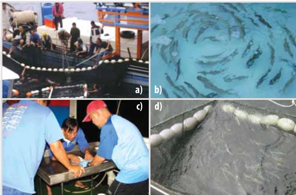
Tagging activities in Brunei Darussalam: a) Transfer of live fish from purse seine to holding cages; b) Healthy fish for tagging; c) Tagging process ensures proper handling of fish; and d) Active tagged fish ready to be released.

The tagging operations were conducted in the South China Sea and Andaman Sea in 2010 where the target species included the Indian mackerel ( Rastrelliger kanagurta ), Indo-pacific mackerel ( R. brachysoma ), shortfin scad ( Decapterus macrosoma ), and Japanese scad ( D. maruadsi ), which are also the major species exploited by the fisheries in the region, especially using purse seines. Until December 2010, a total of 12,600 fishes were tagged in the Andaman Sea comprising 56% of the target number of the fishes to be tagged. The percentage of achievement was slightly lower in the South China Sea where only 44% of the target 54,400 fishes were tagged. Information of the tagged fish was verified and